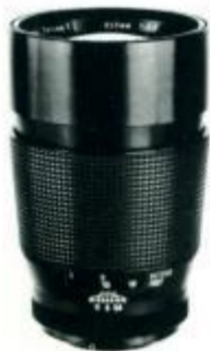
Vivitar Series 1

Another factor in determining depth of field is the focal length of your lens. Because of its longer focal length, the depth of field of your Series 1 telephoto lens is shallow even when the lens is fully stopped down. Therefore, you should always take the time to focus properly. Creatively, the shallow depth of field can be used to add impact to your pictures by providing you with pleasing, out-of-focus foregrounds or backgrounds. As shown, in portraiture a soft, out-of-focus background provides "separation" and makes your subject stand out.