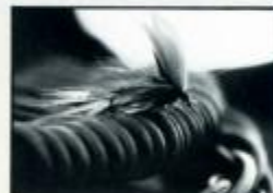
Macro focus at 1/3 life size